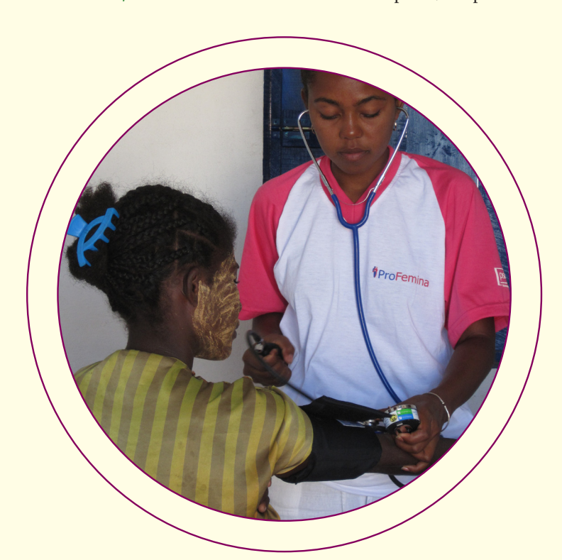
Blue Ventures' clinical technician monitors a patient's heart rate (Photo: ©Matthew Erdman).

tence (until recently) of a major government drive to promote universal access to family planning, and widespread acknowledgement of the effect of human demographic trends on the environment and economic development.