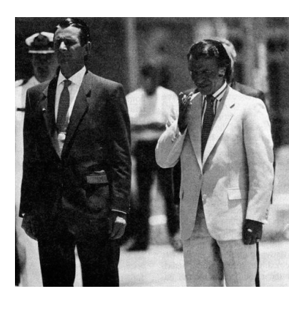
FERNANDO COLLOR AND CARLOS MENEM MEET AT FOZ DO IGUAÇÚ TO SIGN THE MUTUAL INSPECTIONS AGREEMENT, 28 NOV 1990

This panel is devoted to the legacies of Sarney and Alfonsín in the nuclear bilateral relationship. Participants discuss the full adherence of both countries to the Treaty of Tlatelolco and the creation of a common system of accounting and control of nuclear materials, as well as cross inspections. The panel then turns to the tenure of Carlos Menem in Argentina and Fernando Collor de Mello in Brazil as of 1989, and the process whereby the two countries joined the global regime of missile controls (MTCR) and to the Non-Proliferation Treaty (NPT).