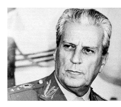
GENERAL LEONIDAS PIRES GONÇALVES, HEAD OF THE BRAZILIAN ARMY

A few days before the inauguration of Alfonsín, Foreign Minister Guerreiro suggested to Foreign Minister Caputo a proposal to joinly renounce peaceful nuclear explosions (PNEs).<sup>34</sup> This happened less than one month after the Argentine declaration about enrichment at Pilcaniyeu. A few months later, Guerreiro's advisor Roberto Abdenur presented the proposal once more to the Argentines to this effect. The Argentine reaction was positive, but Brazil ended up taking it back because there was no consensus at home, possibly among the military. Was the Argentine side aware that this proposal would be made?