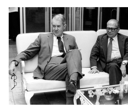
CYRUS VANCE AND AZEREDO DA SILVEIRA MEET IN BRASILIA

My perception is that in fact the personalities involved may have contributed to delay a little the technical cooperation agreement that basically regarded the level of Itaipu and that of Corpus in order to make both compatible so that the waters from one did not flood the turbine chambers of the other. The agreement was being negotiated during the administration of President Geisel and Foreign Minister Azeredo da Silveira. The essence of that agreement was practically ready by the end of the administration. However, at some point, a decision was made to leave the final solution of the issue to the Figueiredo