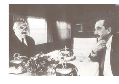
SARNEY AND ALFONSÍN SHARE A MEAL AT PILCANIYEU, 1987

This panel discusses the interpersonal dynamic between Presidents Alfonsín and Sarney. It details their meeting in Foz do Iguaçu in 1985. It then deals with mutual intelligence activities, and it sheds light on the question of the boreholes at Serra do Cachimbo in Brazil. It finally tells the story of how a bilateral working became a permanent committee for bilateral nuclear negotiations.