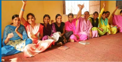
PRACHAR Bihar, India