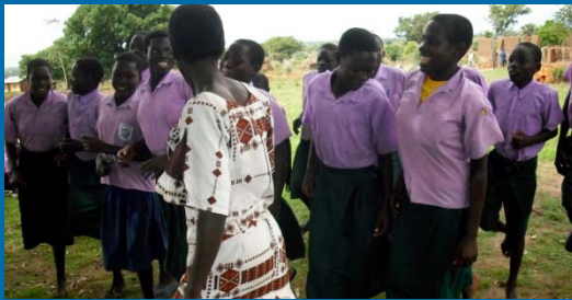
GREAT Project Northern Uganda