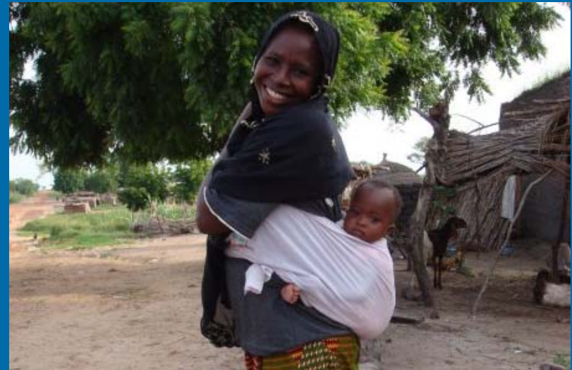
Adaptation to Burkina Faso, Guinea, and Niger