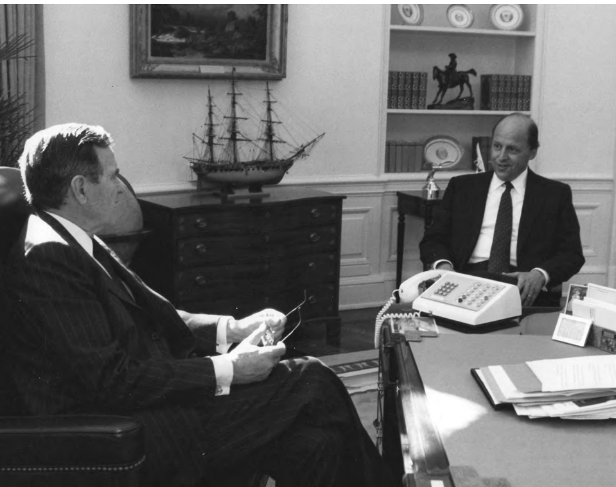
JOHN D. NEGROPONTE