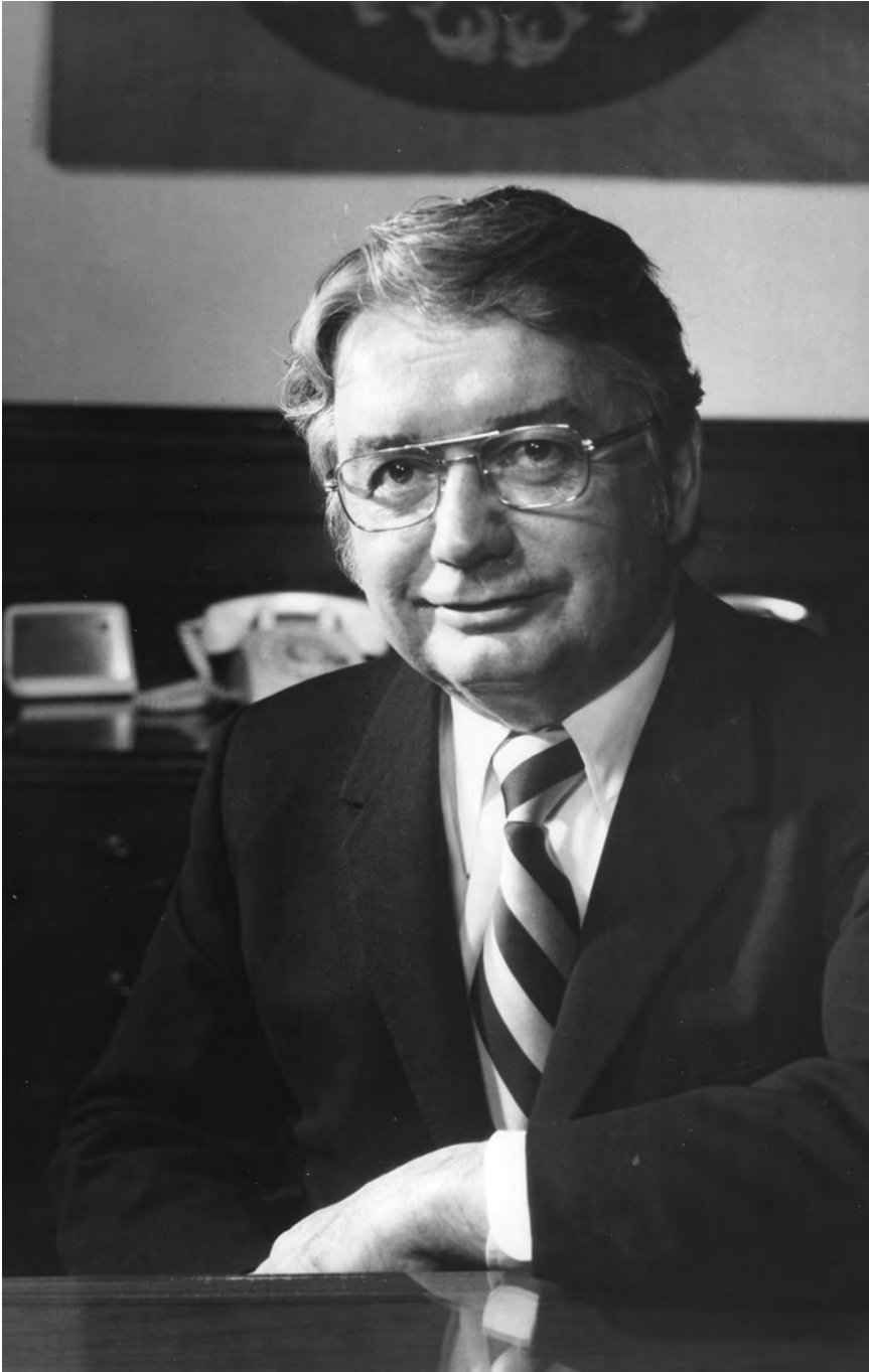
PATRICK J. LUCEY