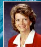
Senator Lisa Murkowski (R-AK)