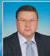
Georgy Karlov Deputy, State Duma, Russian Federation