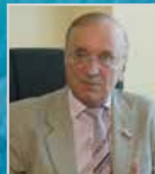
Senator Igor Chernyshenko Russian Federation