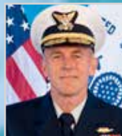
Admiral Paul Zukunft Commandant, U.S. Coast Guard