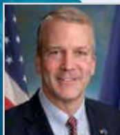
Senator Dan Sullivan (R-AK)