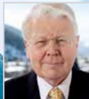
The Honorable Ólafur Grímsson Former President of Iceland