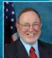
Congressman Don Young (R-AK)